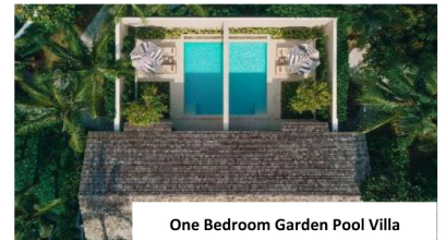
One Bedroom Garden Pool Villa