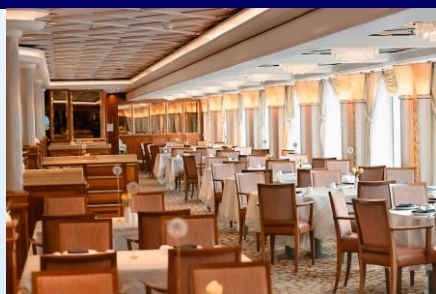
半島餐廳 / 東方餐廳 (主餐廳)