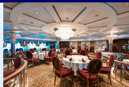
絲路餐廳 (收費中餐廳)