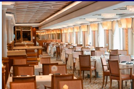
半島餐廳 / 東方餐廳 (主餐廳)