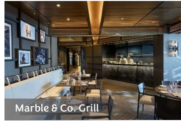
Marble & Co. Grill